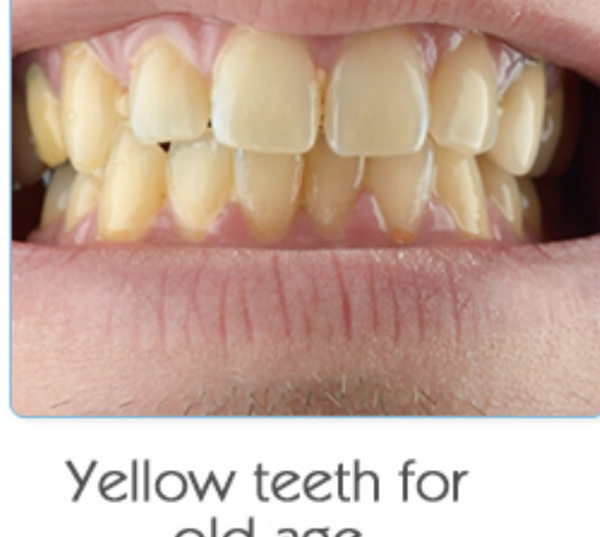
Yellow teeth for old age